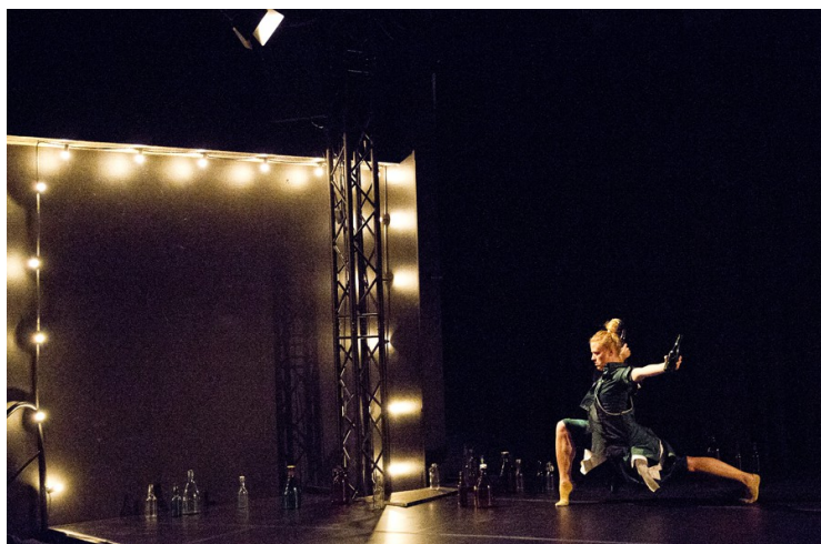
Old people, odd people 2016