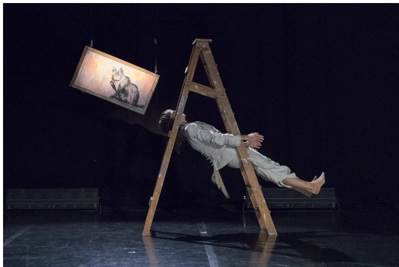
Nine lives, 2017